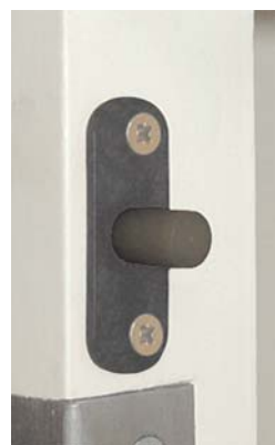
Installed blocking element SLIM-LOCK

In the event of counterpressure occurring which is above permissible levels or jamming while the bolt is being retracted or inserted, the control unit makes a number of attempts to solve the problem on its own. Actuation is interrupted and a fault signal generated if this proves unsuccessful.